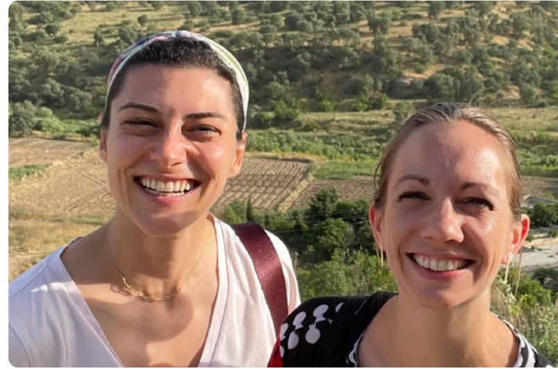
Then and now! December 2016, Duhok (left) and June 2023, Sulaimani (right).